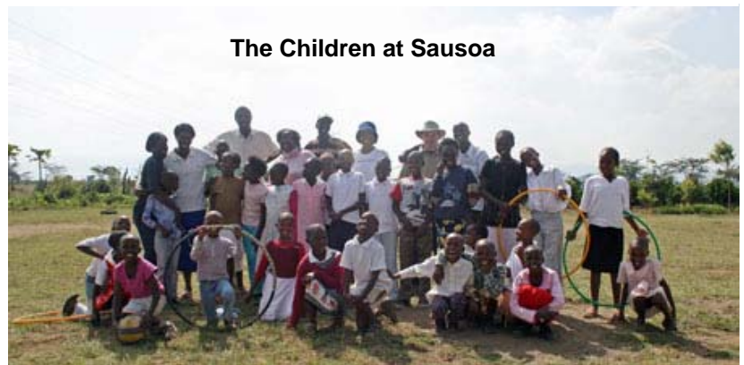
The Children at Sausoa

Even though our trip was short, we were able to visit with the Orphans at Sausoa (the orphanage is operated by The Brigade Captain and her husband, supported by Thomas Barnardos). A wonderful day was spent listening to and talking with the children in between playing volleyball in the garden. For all the gifts we took them were hugely appreciated, the greatest gift is love. For these children and indeed all the young people of Ololua the time we spent with them was worth more than any material object we left behind, a point not wasted on us.