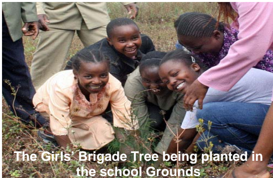
The Girls' Brigade Tree being planted in the school Grounds

The children of Oloolua will benefit from this facility for many generations to come, bringing permanent positive change to the lives of so very many children. There are a great many problems Africa has yet to surmount and there is no doubt this is but a small step on that road, however it is in many ways a giant leap for these children, with education their future is undoubtedly improved and many of these children already speak of what they will do for others when it is their turn. If Christian people four thousand miles away can find a way to do this for them when all they had to depend on was prayer, it is a fitting accolade that with this new future ahead, they themselves wish most of all to be able to answer someone else's prayer in their lifetimes and believe so strongly that through education they will have the skills and finance to do so.