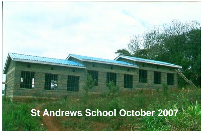
St Andrews School October 2007

Back in July we found ourselves standing at Oloolua getting our first glimpse of the building work. It is difficult to convey the buzz of excitement and anticipation that flows through the Parish as this project makes its way from dream to reality. The first three classrooms are nearing completion now. The roof and windows / doors all in place work has commenced on the interior finishing and kitting out of these classrooms. Building has commenced on the sanitary facility and water filtration unit. In January a small group of us will return to Kenya once again to visit the site and begin planning for October 2008 when we intend to take a group of young men from the Companies involved in this project to Kenya for the 'Official' opening of the School and to spend time working with and teaching in this wonderful facility.